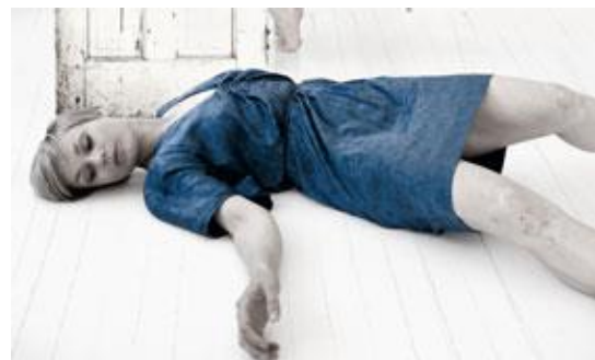
Carte Blanche: 3 o'clock in the Afternoon (NO) www.carteblanche.no