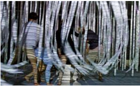
ccap/Christina Caprioli: Out-Outs & Trees(SE) www.ccap.se