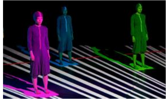
Recoil Performance Group: Fuck You Buddy (DK) http://recoil-performance.org/