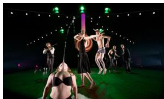
Mute Comp. Physical Theatre: Grasping The Floor With The Back Of My Head (DK) www.mute-comp.dk