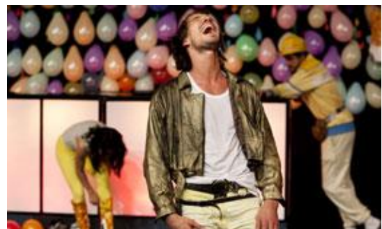
Reich + Szyber:Unknown Pleasures (SE) http://reich-szyber.com/