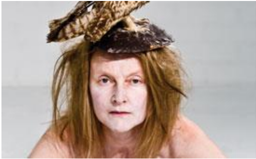
Kekäläinen & Co: Onni-Bonheur-Happiness 2 (FI) www.kekalainencompany.net