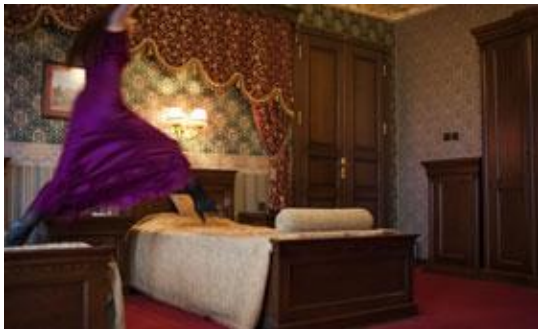
Charlotte Engelkes: Curtain Call (SE) http://www.charlotteengelkes.com/