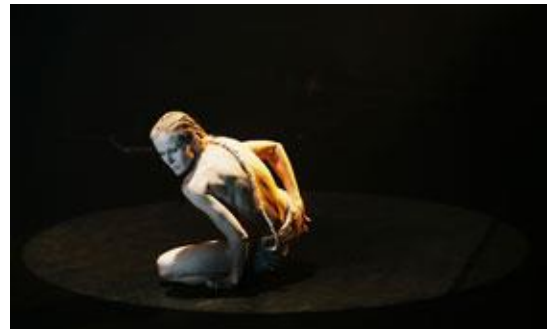
Kitt Johnson X-act: Rankefod – An Evolutionary Solo Performance In Celebration Of The Origin Of The Species (DK) www.kittjohnson.dk