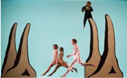
Lotta Melin/Agrare: A Safe Place to Die (SE/NO) http://lottamelin.com/sv