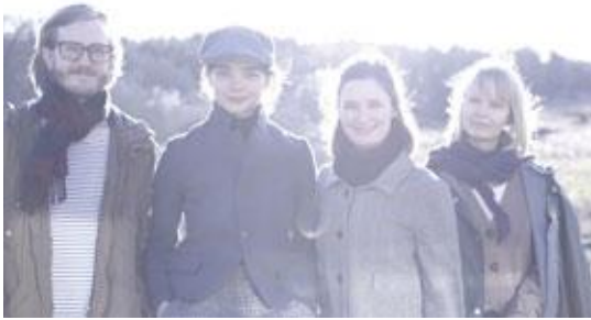
Gunilla Heilborn: Femårsplanen (SE) http://gunillaheilborn.se