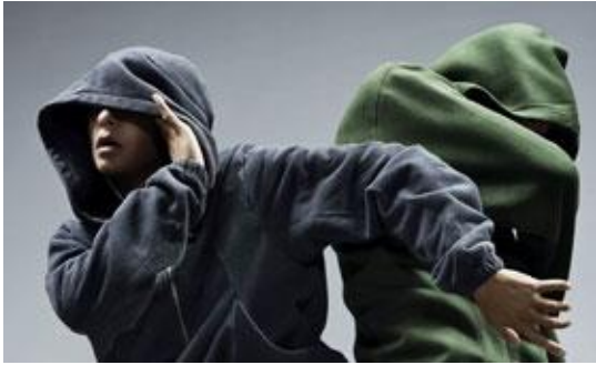
Cullberg Ballet: JJ's Voices (SE) http://www.cullbergbaletten.se/