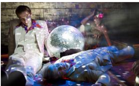
Karttunen Kollektiv: Karttunen Kollektiv: Days Of Disco (FI) www.karttunenkollektiv.fi